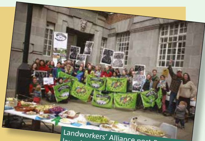
Landworkers' Alliance post-Brexit policy launch event at DEFRA, 'A place at the table', April 2017.

Find out about the In our Hands film and how to watch it: https://inourhands.film/